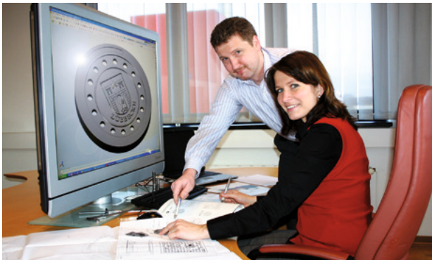
A motif is built.

The templates for the special scenes can be varied. For example it's possible to use 2D-drawings, graphics or also pictures. First of all Meierguss creates from the basis a CAD-model.