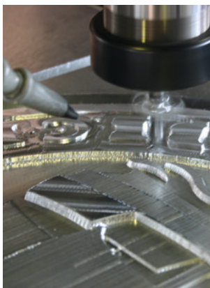
Now the model plate will be milled in the model shop.

From the drawing to the finished motif manhole cover!