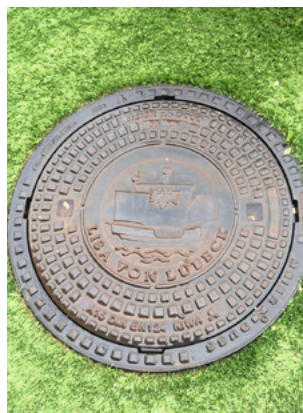
The German Hanseatic Ship „Lisa von Lübeck“ sails on the motif manhole cover from MeierGuss.